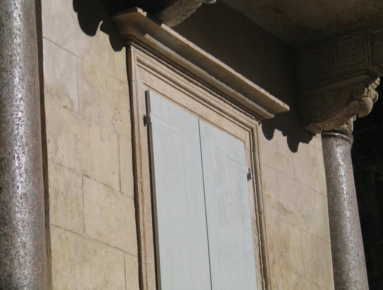
Top photograph: Detail of the façade after the conservation-restoration operation