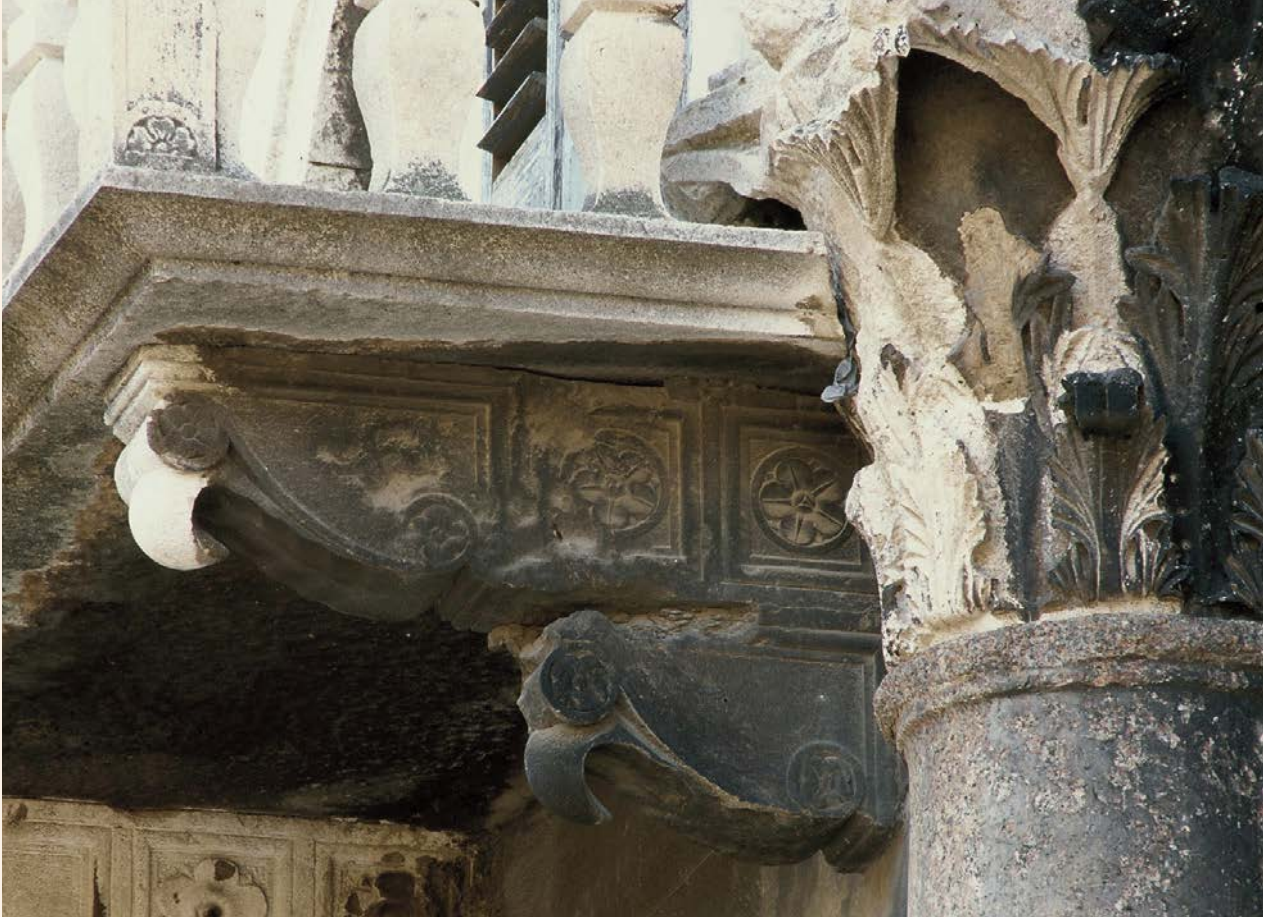
Photograph: Detail of the façade of the Skočibučić-Lukaris Palace, the condition before the conservation-restoration operation

as well as limestone and granite, plaster also appeared on the façade, and its as-found condition was fairly poor.