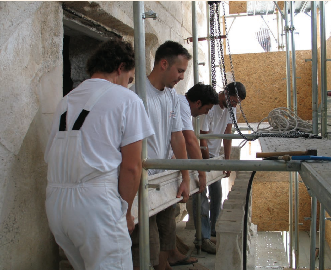
Photograph: Assembly of the stone balustrade of the balcony

One of the most demanding operations was the disassembly and reassembly of the railing of the balcony on the second floor. The missing pillar of the railing was carved in new stone. Structural damage was repaired with artificial stone. Worth mentioning are the reconstruction operations on the Renaissance