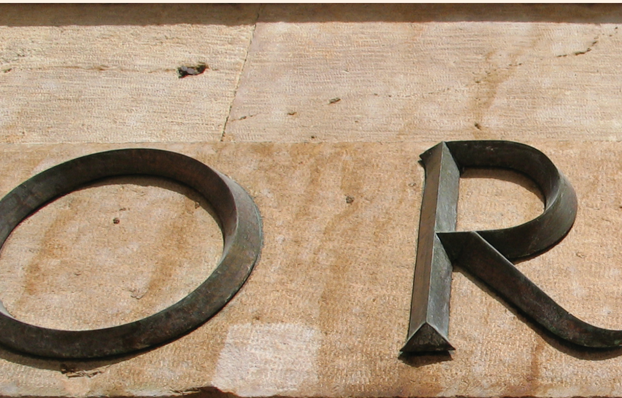
Bottom photograph: Same detail, after laser cleaning