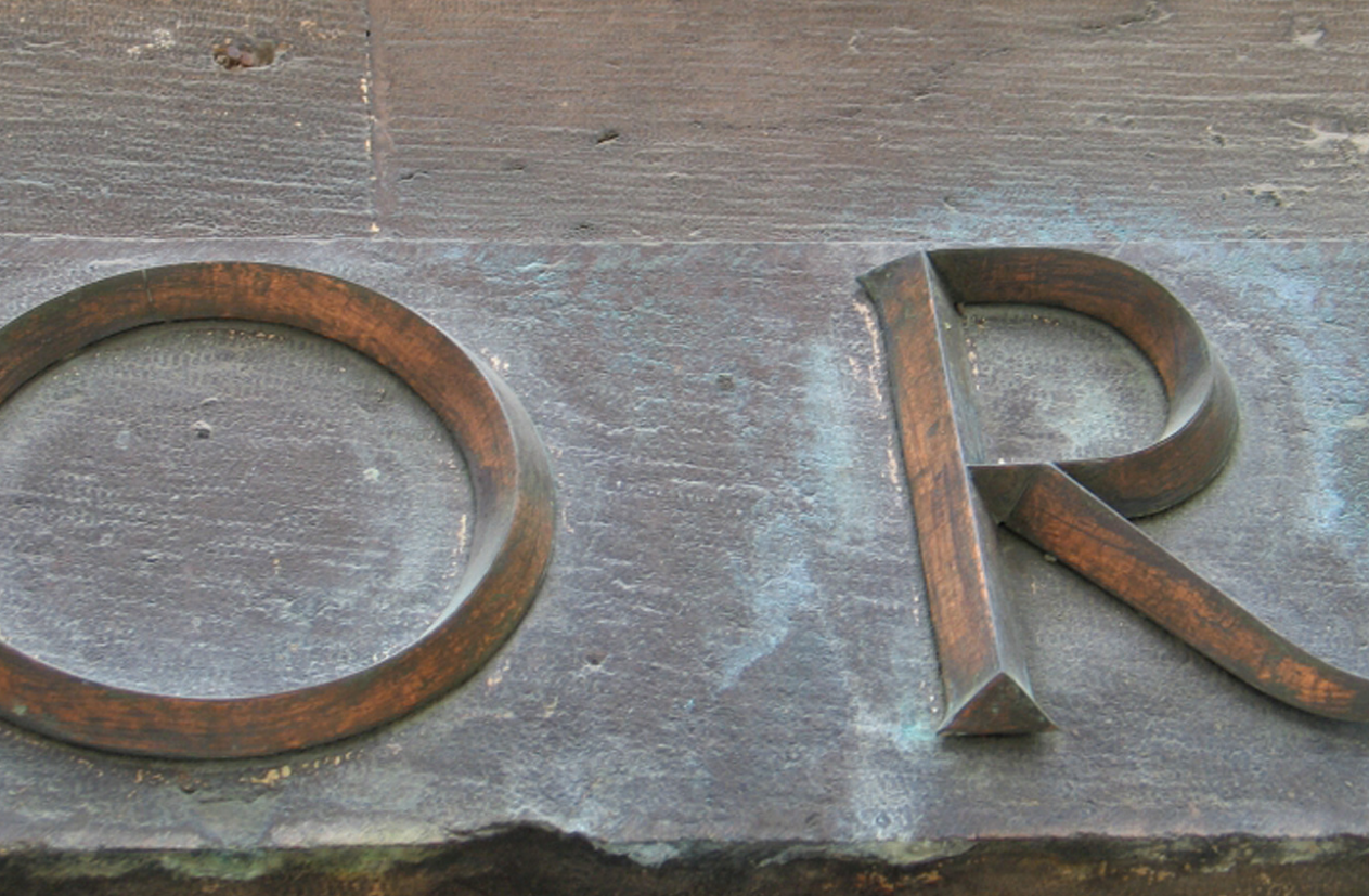
Top photograph: Detail of the architrave of the portal in the ground floor of the Grisogono-Cipci Palace, condition before the operation